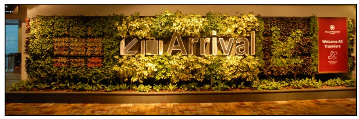
We saw this sign at the Airport, coming and going!

Even leaving the airport there were more plants.