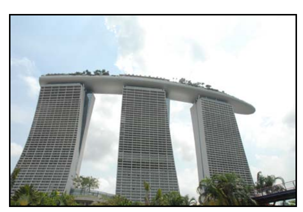
Marina Bay Sands Hotel

There is an underwater pumping system at Dragonfly Lake. It draws in water from the Marina Reservoir, circulates water through the Gardens and discharges it back into the reservoir. The Dragonfly Bridge connects the Garden to the Marina Bay Sands Hotel.